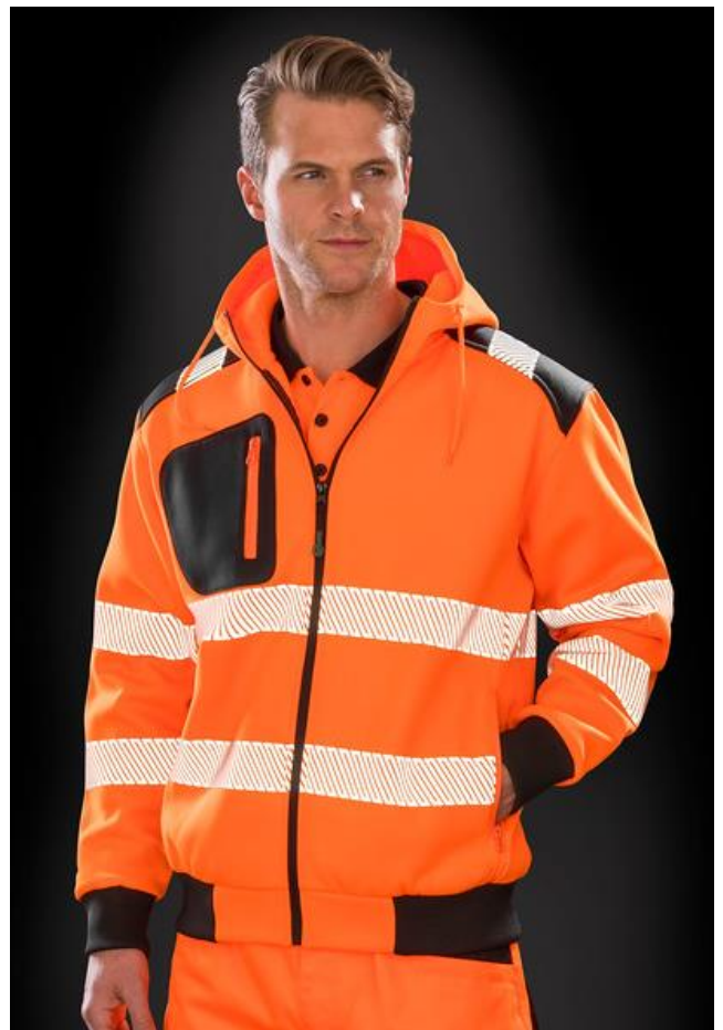
R503X RECYCLED ZIPPED SAFETY HOODY