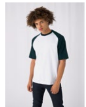
Exists in B&C Base-Ball